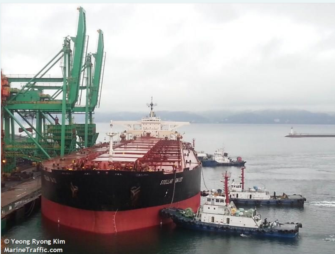
Picture of the MV Stellar Daisy

Uruguay's navy has told Reuters that it is losing hope of rescuing the remaining 22 crew members from the Stellar Daisy after it sank in the South Atlantic on Friday some 3,700 kilometers off Uruguay's coast.