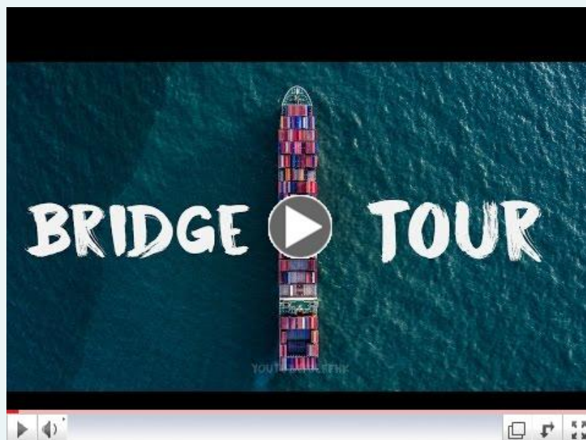
Mega Ship Bridge Tour